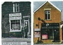
45 High Street