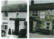
Cricketers Arms, Littlewerth