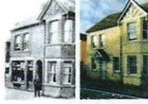
* 94 Church Road