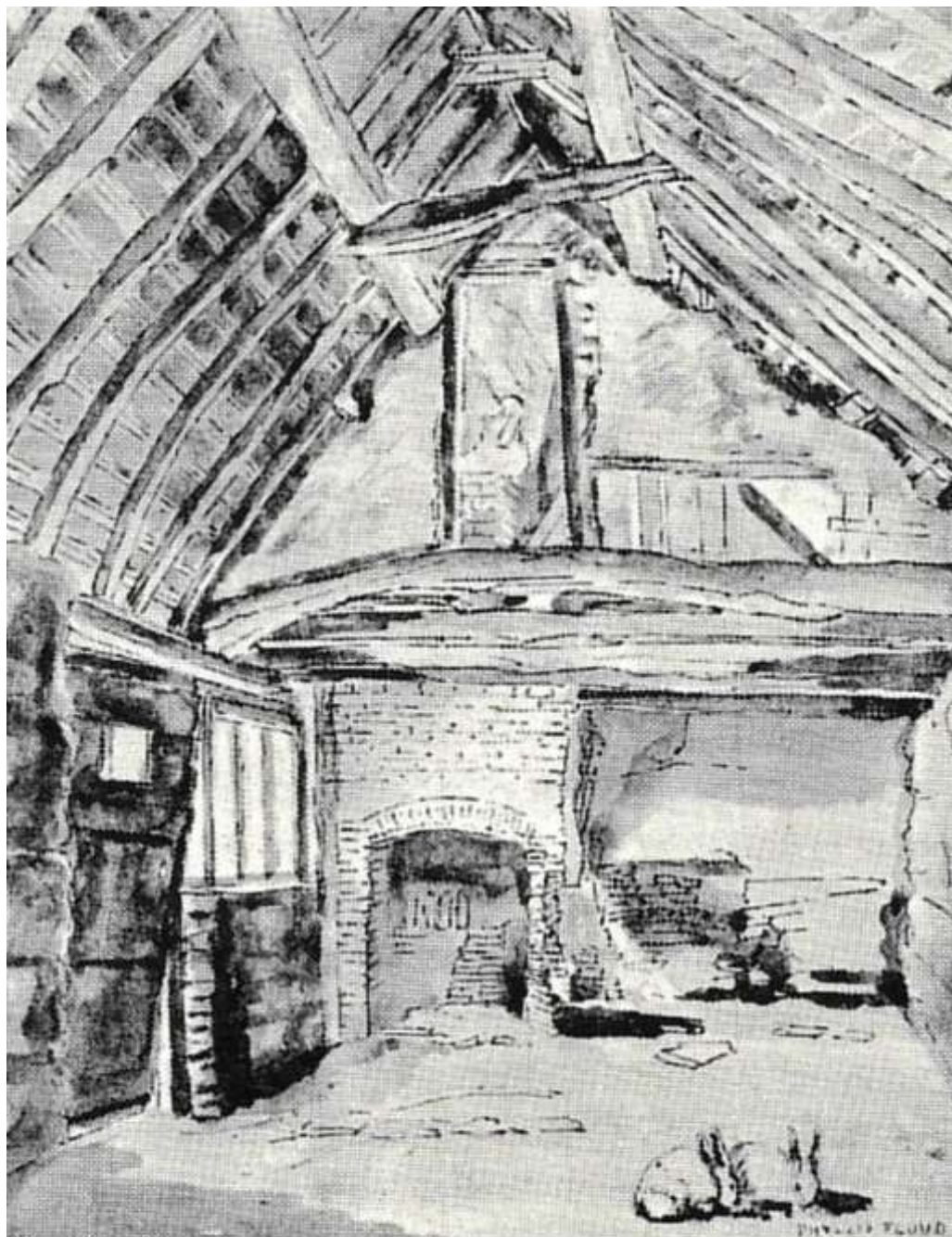
Plate 48. COTTAGE INTERIOR OF MEDIEVAL HALL AND BOWER TYPE.